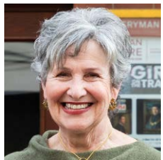
Everyman Theatre Cheltenham

Life is often hard for those we welcome at our Guest Hub. We meet them with kindness, recognising that not everyone has had the care or space to address issues in their lives. Guests have the option of seeing our psychotherapist, volunteer doctors or podiatrist. We also advocate for our guests in medical settings and towards housing solutions, and help them access addiction support and mental health care. To all, we offer reassurance, friendship and a place to belong.